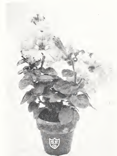
Well grown 3-inch pot Pride of Portland Petunia showing quality to perfection

A new selection, resembling a giant of California, large ruffled edges, soft heliotrope with network of darker veins radiating from dark colored throat. Vigorous thrifty grower, branching freely.